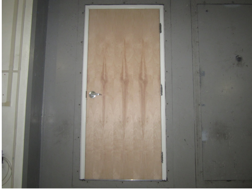
Receive Room View of an Installed Test Specimen