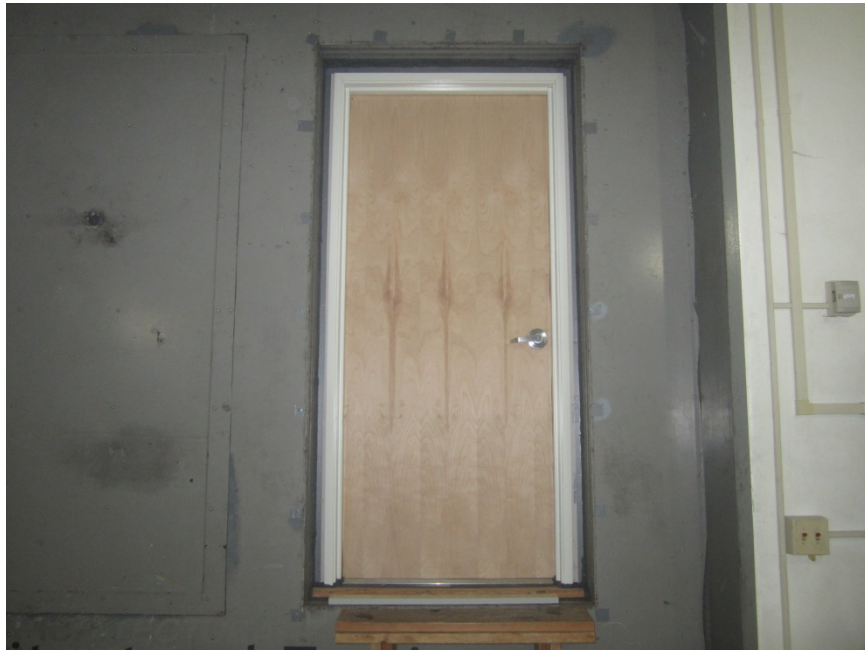
Source Room View of an Installed Test Specimen